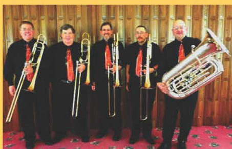
June 5 Back Row'd Brass (Trombone Ensemble)