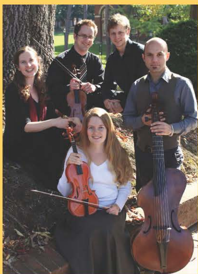
May 29 Three Notch'd Road Baroque Ensemble